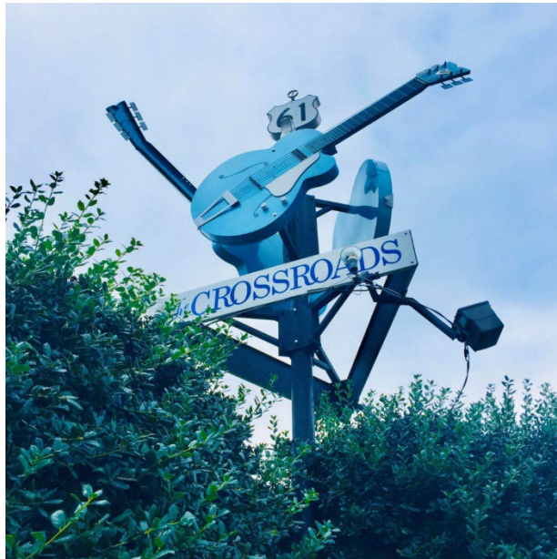
The Crossroads