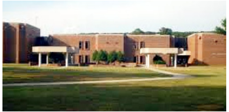
J. O. Johnson High School