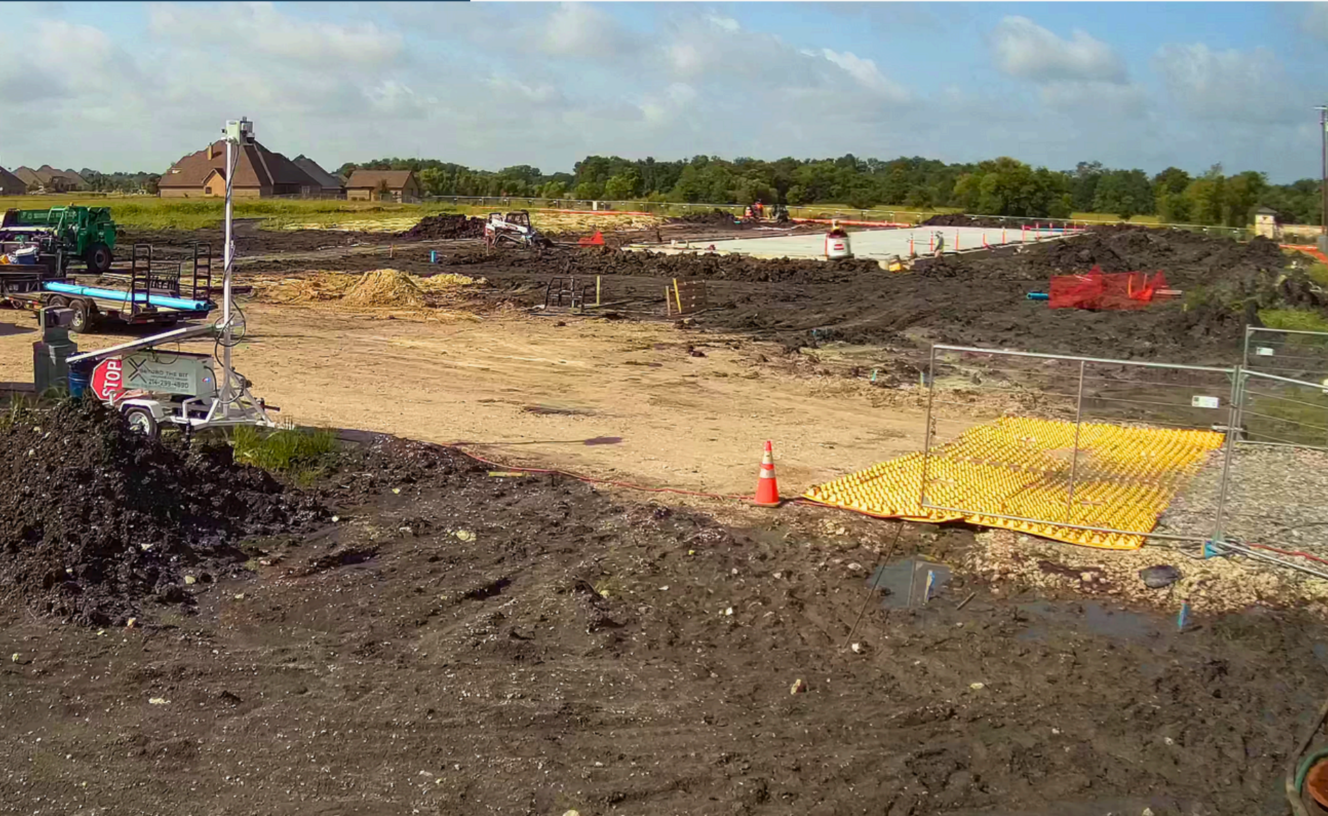
JUNE 2025 | CONCRETE SLAB POURED