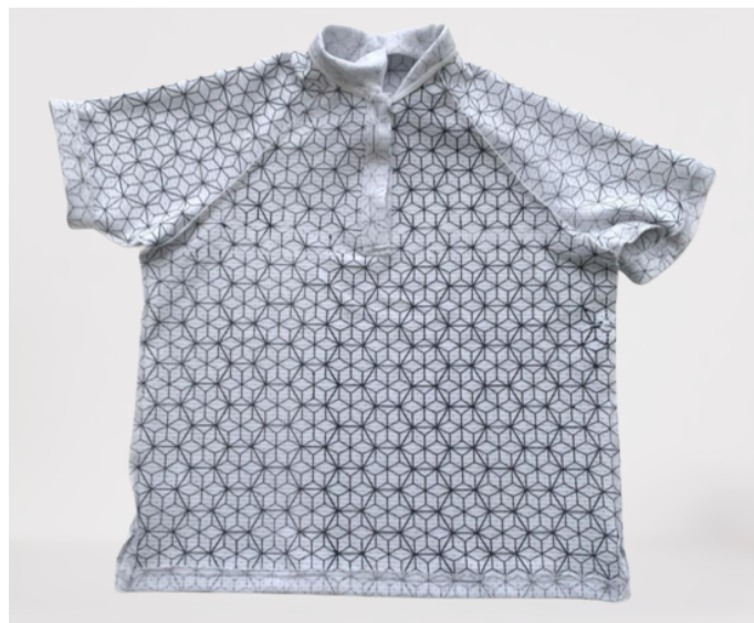
Fig. 4 Graphene-Wear™ formulations printed onto textiles that were fabricated into gym tops (upper) and tennis tops (lower).