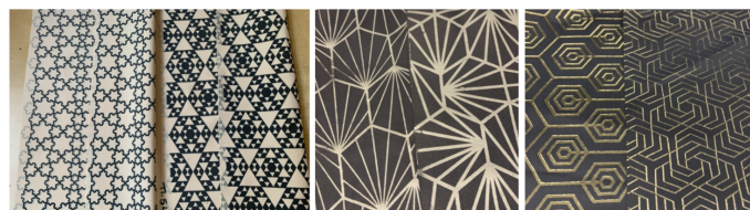
Fig. 3 Testing Versarien's ink formulations in different binder systems and printing on different substrates.

Versarien also began collaborating with the Royal College of Art (RCA) , London, with RCA academic and postgraduate staff assisting in the creation of several sportswear designs with basic design templates given by Versarien. Ultimately, RCA staff were given creative control over the designs to give striking appearance, whilst maintaining interconnectivity of the printed graphene network (Figure 3). This project involved the use of the Graphene-Wear™ formulations and development of further formulations using different binder systems. The project expanded through three phases; Discovery, Selection and Production.