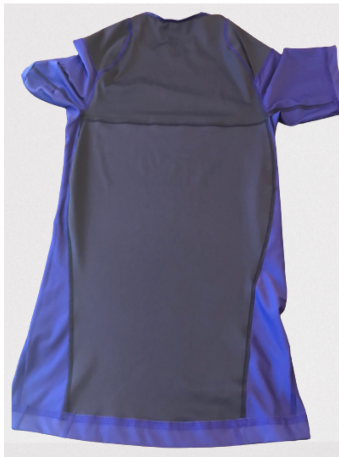
Fig. 5 Generation 1 activewear garments manufactured by MAS utilising Graphene-Wear™ .

Table 3 shows a set of tests that have been performed on Graphene-Wear™ garments to date. Generation 1 garments were produced using complete printed panels with graphene on the inside of activewear baselayers (Figure 5). Testing was carried out by benchmarking the control garment without graphene. The results for Generation 1 garments confirmed stretch recovery with minimal dimensional changes, 10-25% improvement in air permeability, significantly improved wicking (50% and 100% depending on the direction of capillary action), 13-18% improvement in thermal transmittance and a comfort level that exceed the industry standard. Further testing has been performed on Generation 3 garments, as well as a subjective screening assessment for the presence of irritant substances, with criteria and methodologies based on Shirley® Technologies' experience, retail organisations' requirements and the OEKO-TEX® STANDARD 100 (described later). No presence of formaldehyde, oxidising or reducing agents, surfactant residues or dyestuff soluble in cold water was observed. Adding graphene to the base fabric does not make a significant difference to the skin irritation propensity of the fabric.