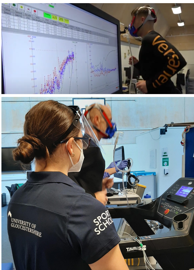
Fig. 6 Subjects performing sub-maximal effort treadmill runs at University of Gloucestershire wearing Graphene-Wear™ baselayers.

The aim of the study was to explore the thermal and moisture management properties of three different semi-fitted, long-sleeved, baselayer tops when worn during exercise, and to assess the wearers' perception and comfort levels whilst wearing the garments. The three garments tested were the Graphene-Wear™ (G-W) generation 3 garment (Figure 7), a garment from a high market share brand marketed to have moisture management properties (G-2) and a garment from a brand with high market share marketed to have moisture and thermal management properties (G-3). In terms of fabric composition, G-W and G-2 are closely matched (92% Polyester - 8% Elastane), while G-3 is ~50% Polyamide - 50% Polyester.