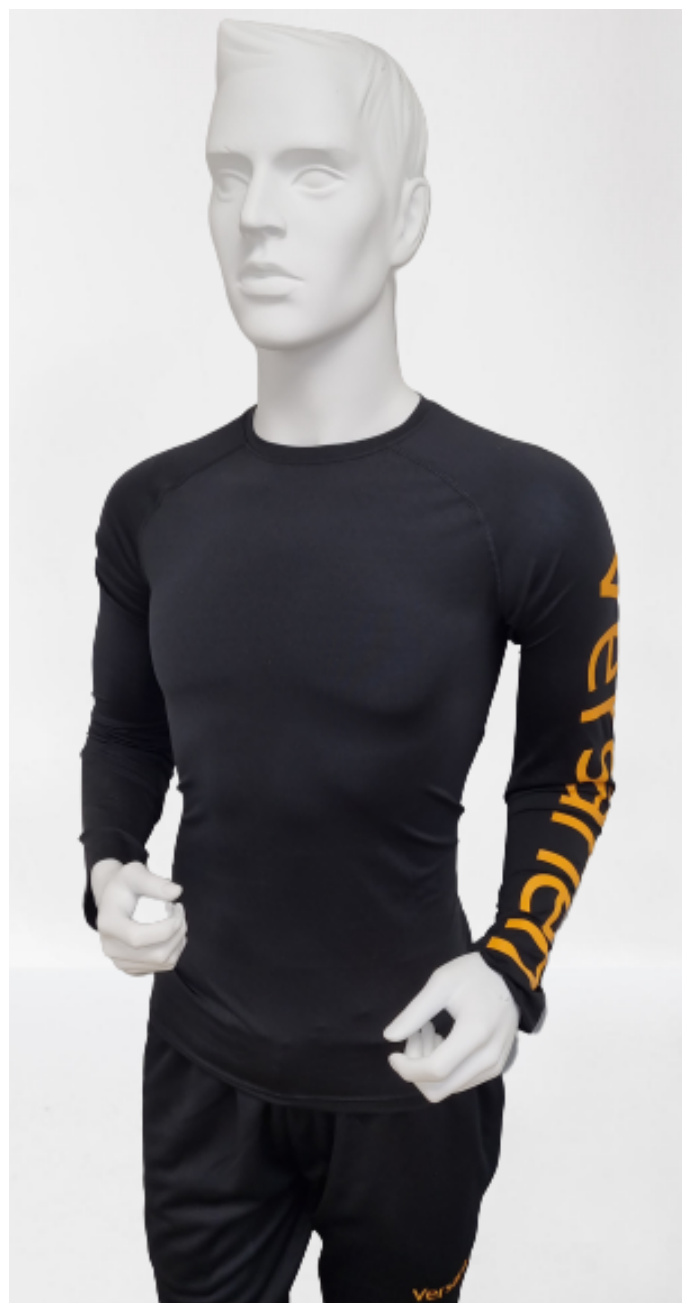
Fig. 7 Generation 3 activewear garments manufactured by MAS utilising Graphene-Wear™ used in University of Gloucestershire wearer trials.

As study subjects, 11 aerobically trained male athletes of an intermediate to elite standard of running (average \text{VO}_2 \text{ max} : 53.00 \text{ mL.kg}^{-1}.\text{min}^{-1} ) were selected. In a random order, subjects performed a sub-maximal effort treadmill run (70% \text{VO}_2 \text{ max} ) for a set duration of 50 minutes whilst wearing one of the trial garments. This was repeated for each garment after a time interval of at least 48 hours. Body mass, garment mass, urine osmolality levels, heart rate, blood samples and internal core temperature were collected/measured every 10 minutes. Finally, after each test, an interview developed by Raccuglia, Holder and Havenith [7] took place to record wetness perception, thermal sensation and thermal comfort.