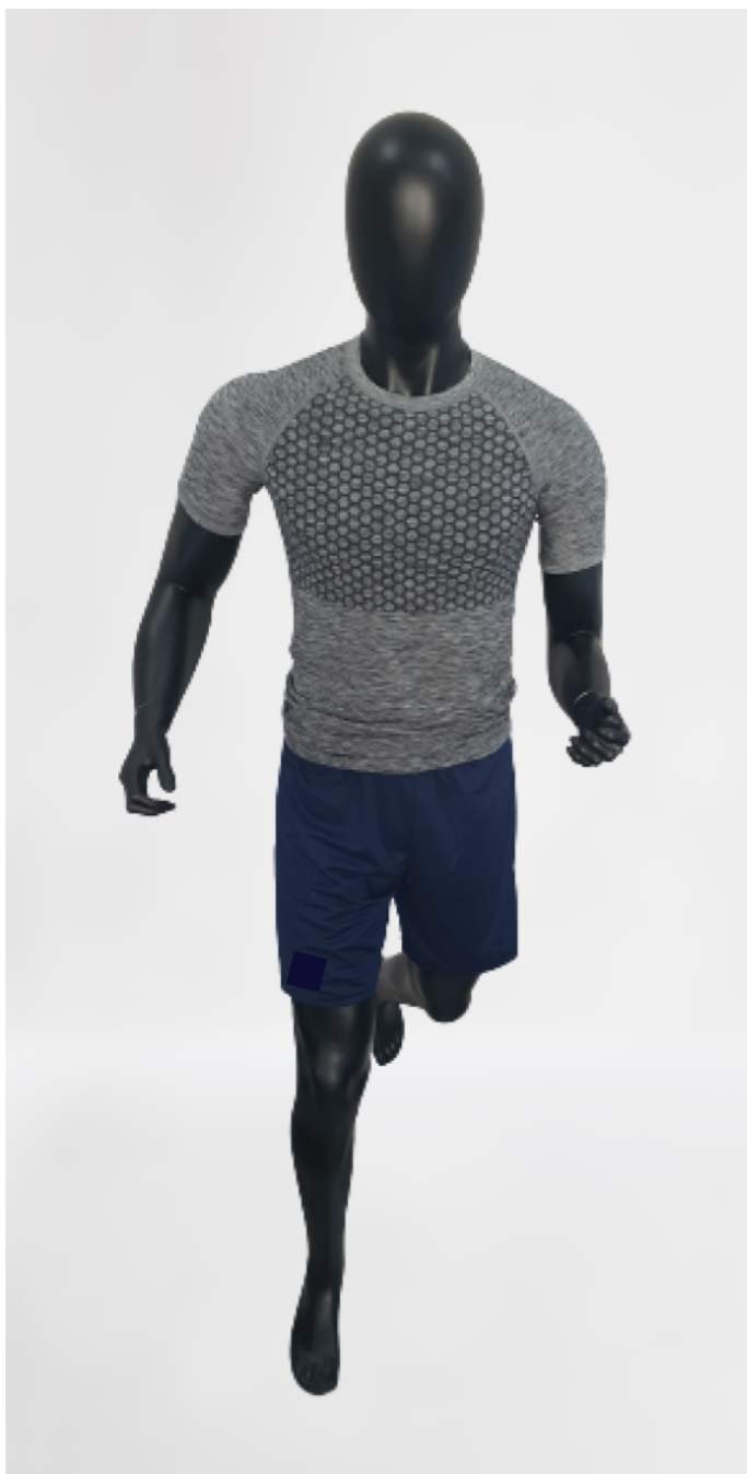
Fig. 2 Generation 2 activewear garments manufactured by MAS utilising Graphene-Wear™.

Versarien's exploits into the textile industry began in 2018 when Versarien subsidiary Cambridge Graphene Limited, a spin-out company from the Cambridge Graphene Centre (CGC) at University of Cambridge, won an InnovateUK funded project "Upscaling novel microfluidisation for repeatable, low-cost creation of quality graphene ink" [4] aimed to validate a pilot scale production of graphene ink from a proven novel, repeatable, microfluidisation process at lab-scale [5], utilising 3 key case studies to establish routes to market.