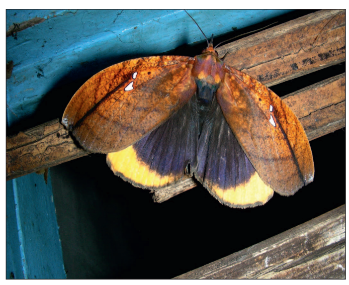
Gioriana ornata. Lama Camp, Eaglenest, Arunachal Pradesh, north-east India, 19 May 2011.

"mixed". These three options are represented by symbols at top of accounts, for brevity, as are whether the species is nocturnal, comes to light, feeds as an adult, impacts on agriculture at some stage in its lifecycle. The flight periods of these moths vary greatly with location and altitude within India and are imprecisely known. No attempt is made to specify them. Instead, Shubha has taken a practical line and simply gives the