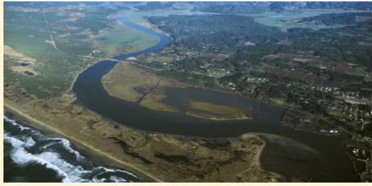
Aerial view of the Bandon Wildlife Refuge

Bandon Marsh National Wildlife Refuge will host their Third Annual Walk for the Wild event on Saturday, September 6th from 10 am to 1 pm at their main office located at 83673 N. Bank Lane.