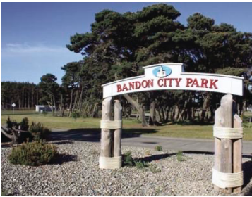
Bandon City Park