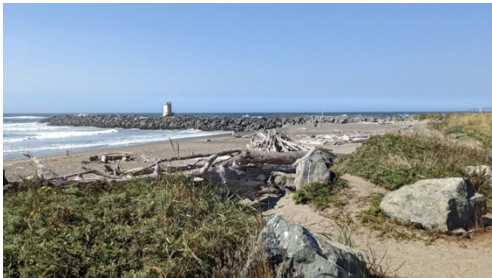
South Jetty Park