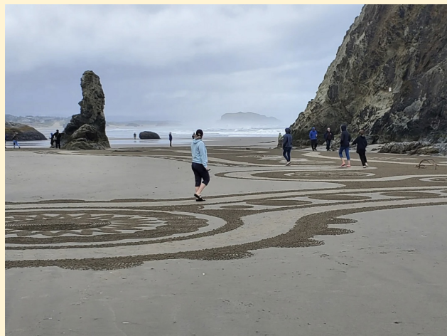
Summer time to recreate on the beach!! Circle in the Sand is a great way to do that!!

Interested individuals are encouraged to contact friendsofbandonpr@gmail.com .