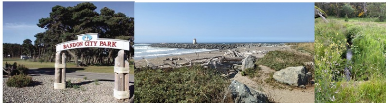
Bandon City Park