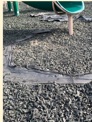
Rubber mulch at the Children's Playground in City Park

Bandon has 100,000 lbs. (50 tons) of rubber mulch (tire crumbs) in City Park's playground. The rubber needs to be disposed of before November/December 2023 when new playground equipment will be installed over a new Engineered Wood Fiber surface.