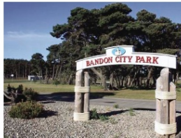
Bandon City Park