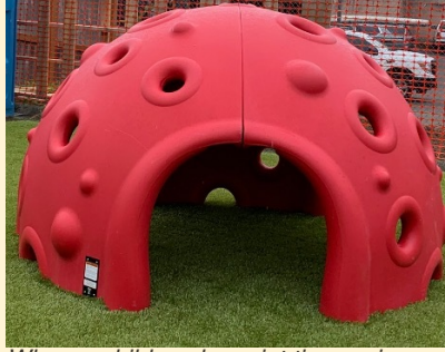
When a child seeks quiet time or is overstimulated, this dome provides space away but has plenty of holes to watch the surroundings.