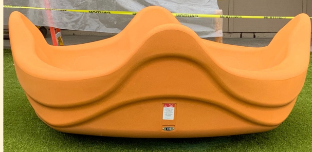
This is a merry-go-round with molded seats. The seats are contoured.