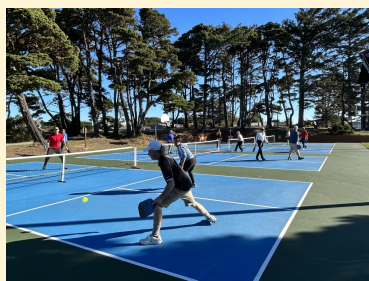
All 4 courts in active use on a sunny late October day!