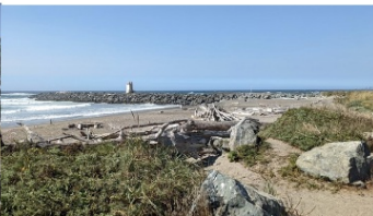
South Jetty Park