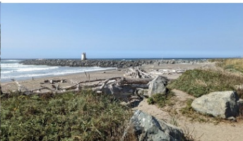
South Jetty Park