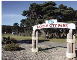
Bandon City Park