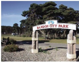
Bandon City Park