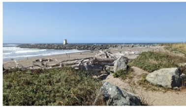
South Jetty Park