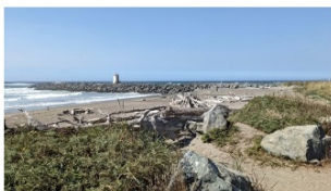
South Jetty Park