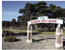
Bandon City Park