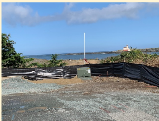
Looking North East from the old Edgewater's Resturant