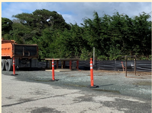
Looking South East from the old Edgewater's Resturant

engineering a path on the river side due to high tides in the winter. The southside of the street poses the issue of underground wiring. So, not so easy. Also, although funding was applied for, it is no guarantee funds will be forthcoming. So we sit and wait. The plan also includes a path around Redmon Pond. For birders, walkers, and photographers, what an experience this will be with the resident blue heron, several species of ducks, and the migrating birds who visit.