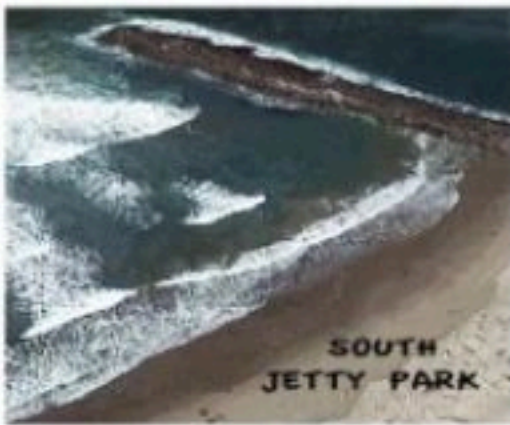
SOUTH JETTY PARK