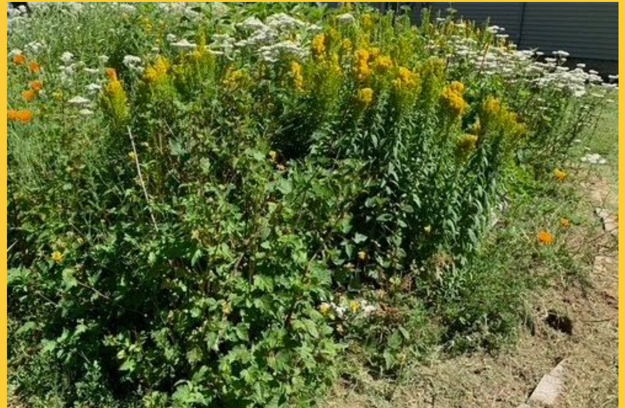
Volunteers planted native garden. Look how it has grown in 2 years!