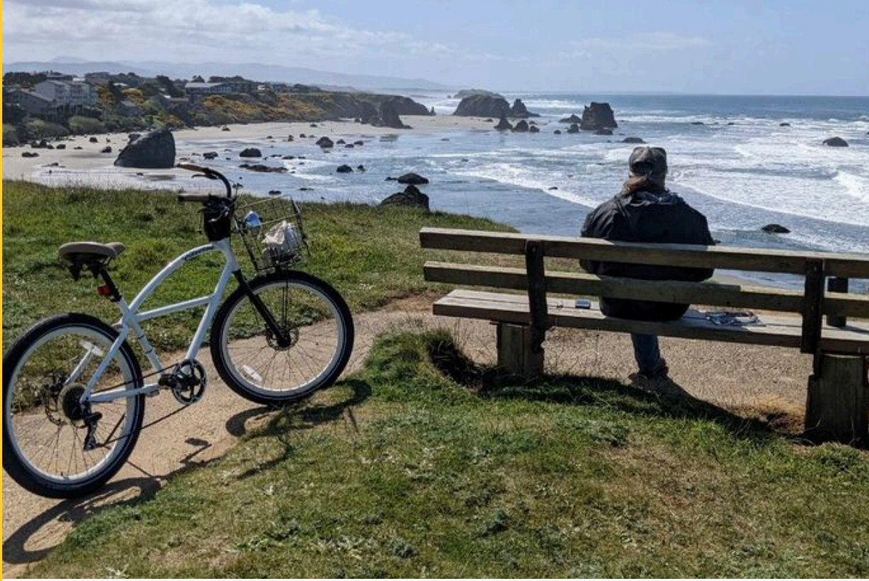
Visitor resting at Coquille Point

* If we all cycled like the Dutch, CO2 emissions would drop by 690 million tons.