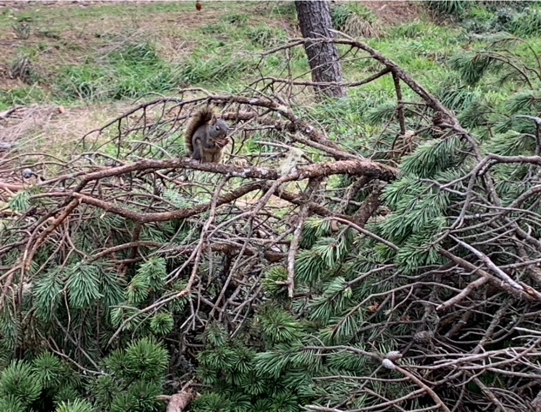
A squirrel after the storm, enjoys a snack while sitting on a downed tree limb in City Park.