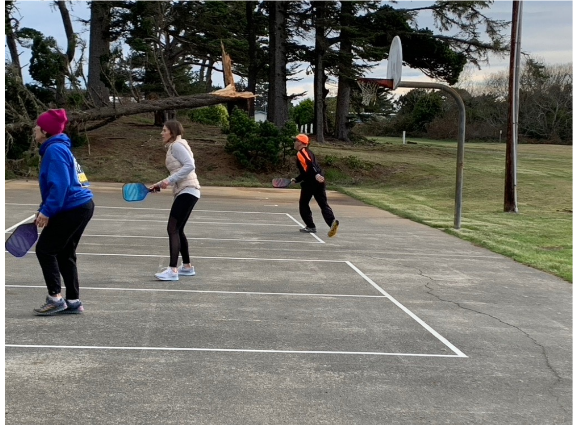
Pickleball on one of our sunny days in January.