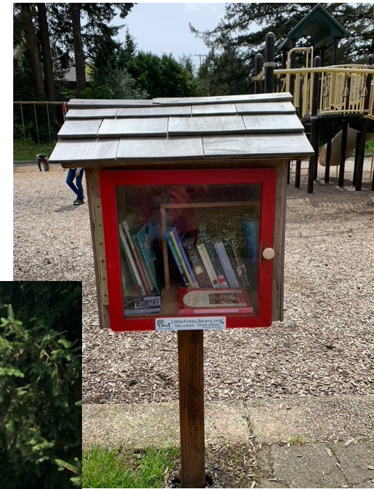
Proposed at the end of the StoryWalk path is a book kiosk similar to this where Free books are there for the taking.