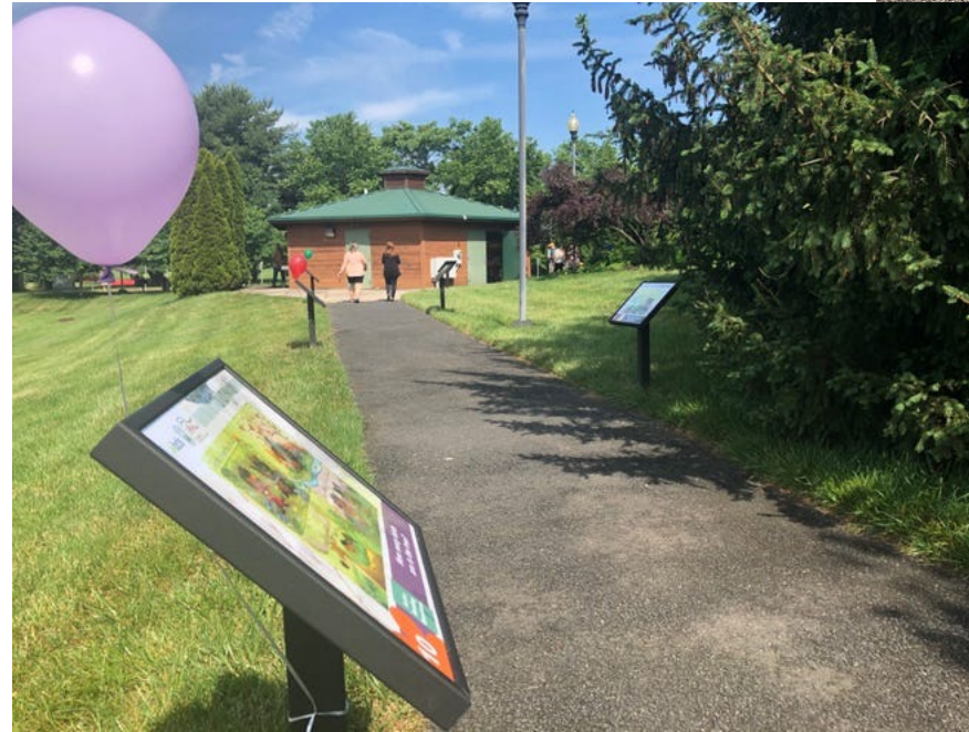
Future StoryWalk path in City Park could look similar to this.

Public Works is also going to widen the gravel paths throughout City Park to better accommodate the StoryWalk route.