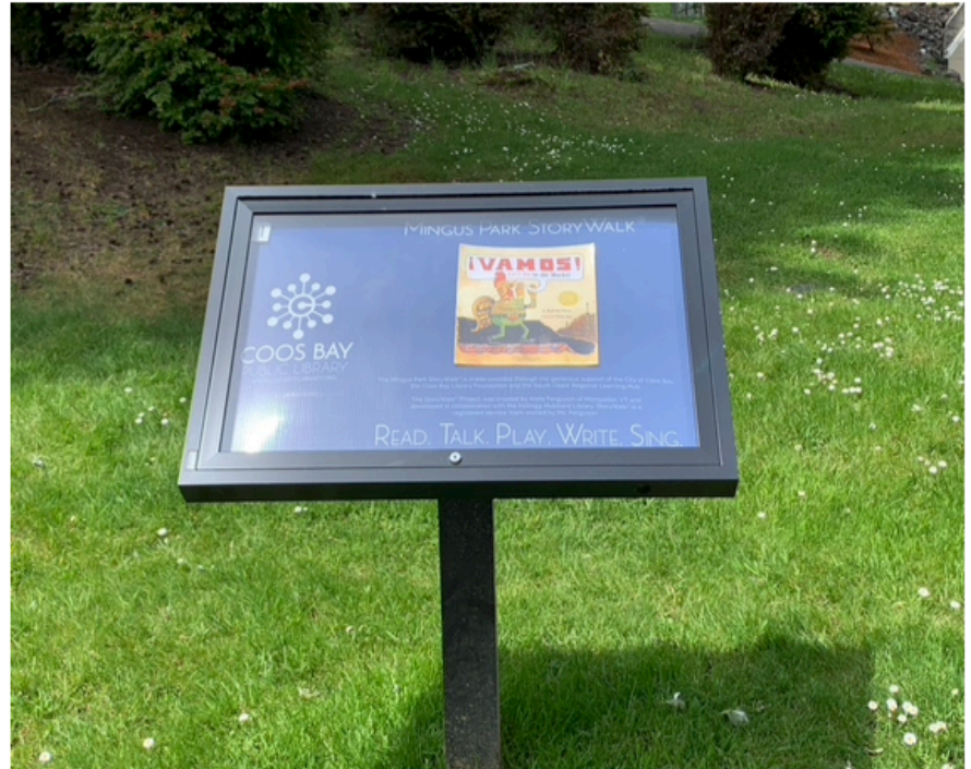
StoryWalk in Mingus Park. Coming soon to Bandon City Park.

Working with our Library by installing kiosks and a meandering path can be hand-in-hand with creating a “move to learn” atmosphere.