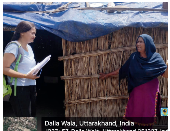
Dalla Wala, Uttarakhand, India 1237157, Dalla Wala, Uttarakhand, 251327, India