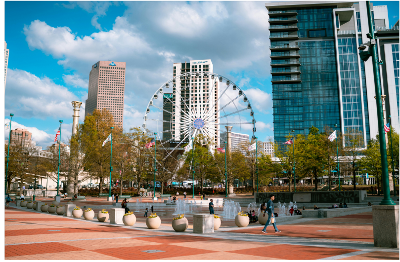
Centennial Olympic Park in Atlanta, Georgia