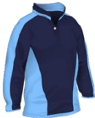
Boys' Rugby Shirt