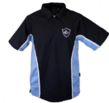
PE Polo Shirt