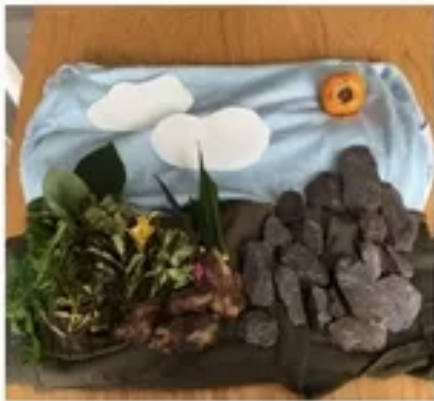
Textured landscape by Jack Murphie Year 7