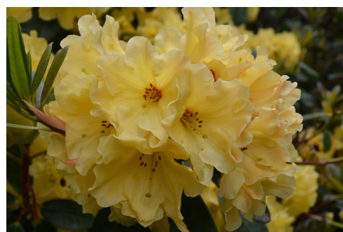
Rhododendrons and azalias flowering at Glendoick gardens in springtime.