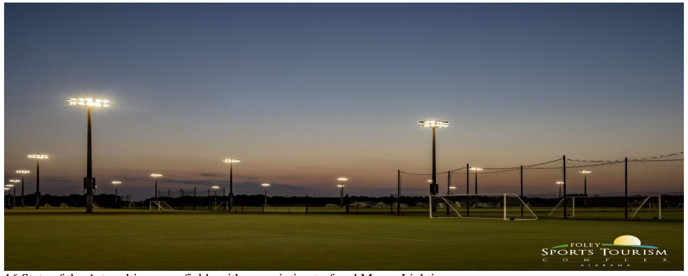
16 State of the Art multipurpose fields with prescription turf and Musco Lighting