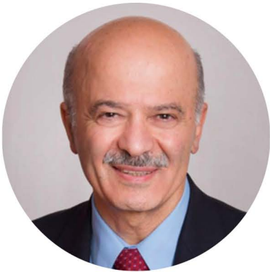
Dr. Reza Moridi

Former Cabinet Minister in Ontario; Minister of Research, Innovation and Science; Minister of Training, Colleges and Universities