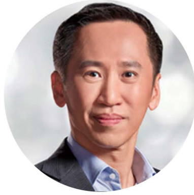
Mr. Chuan Thor

Former Cabinet Minister in Ontario; Minister of Research, Innovation and Science; Minister of Training, Colleges and Universities