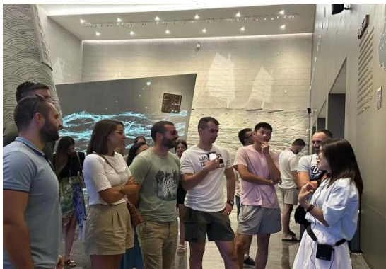
City walk: Zhejiang Eastern Canal Museum