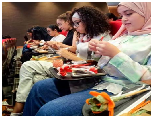
Straw Weaving Skills Practical Class