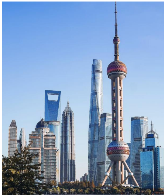
City walk: The Oriental Pearl Tower