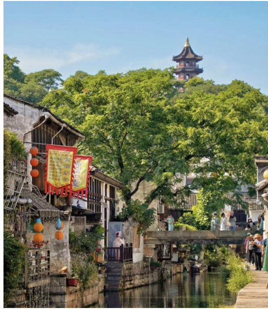
City walk: Hometown of Saint of Calligraphy