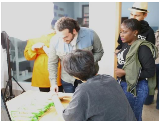
Live Streaming Practical Class