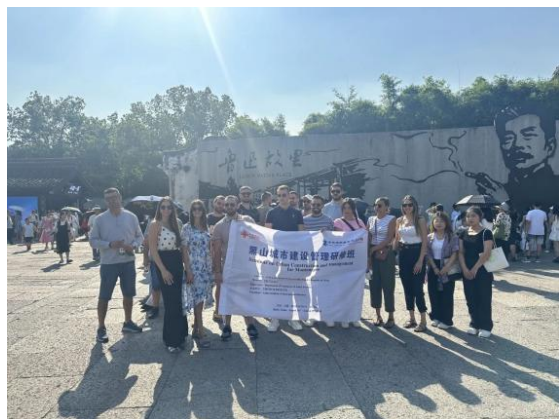
City walk: Lu Xun Native Place