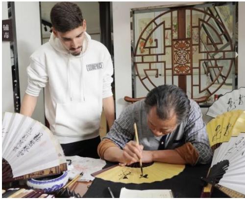
Calligraphy Practical Class