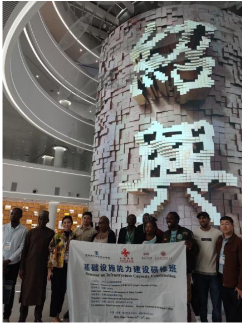
City walk: City Exhibition Hall