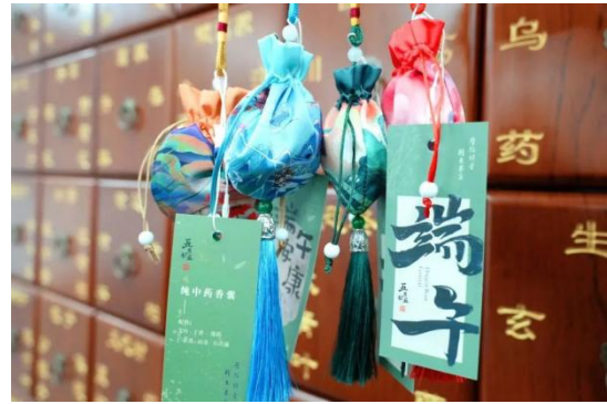
Making Traditional Chinese Medicine Sachets