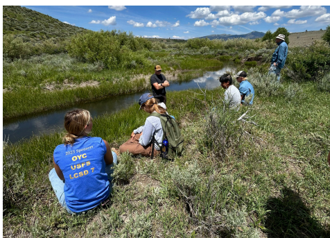
Highschool BDA crew on Camas Creek learning about process based restoration