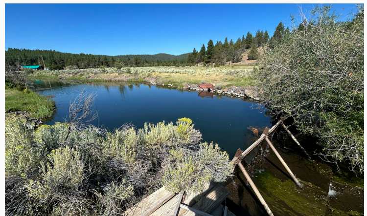
Thomas Creek Grant Development