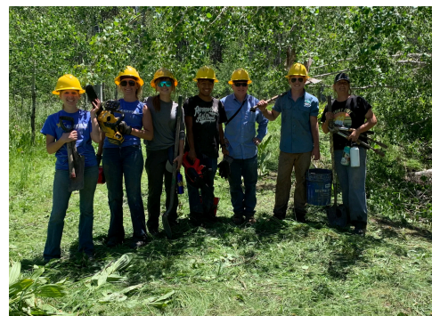
Highschool BDA crew on Day 1 training at Campbell Mill near Cox Pass.