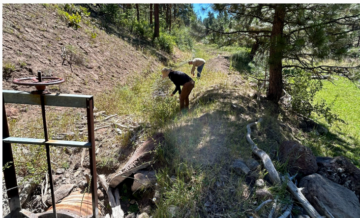
Cox Creek Fish Screen Site