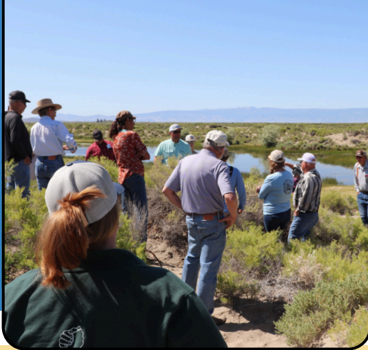
Meadow Resilience Workshop