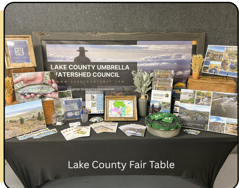
Lake County Fair Table