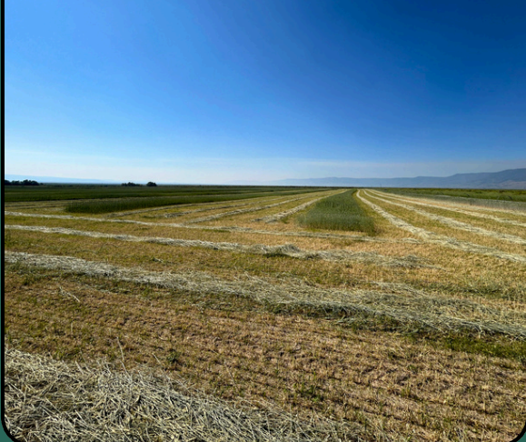
Summer Lake Wildlife Area