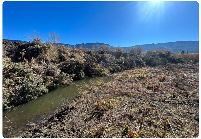
Crooked Creek Streambank Stabilization Project: Before photos Aug. 2023 (left) / After photos Oct. 2023 (right)