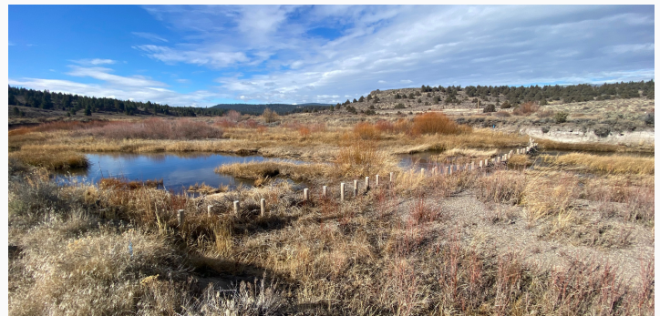
Camas Creek Spring 2023 (left) and Fall 2023 (right)