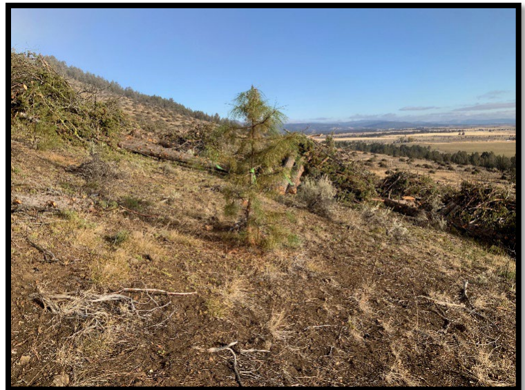
Post-cut looking north 10-23-23