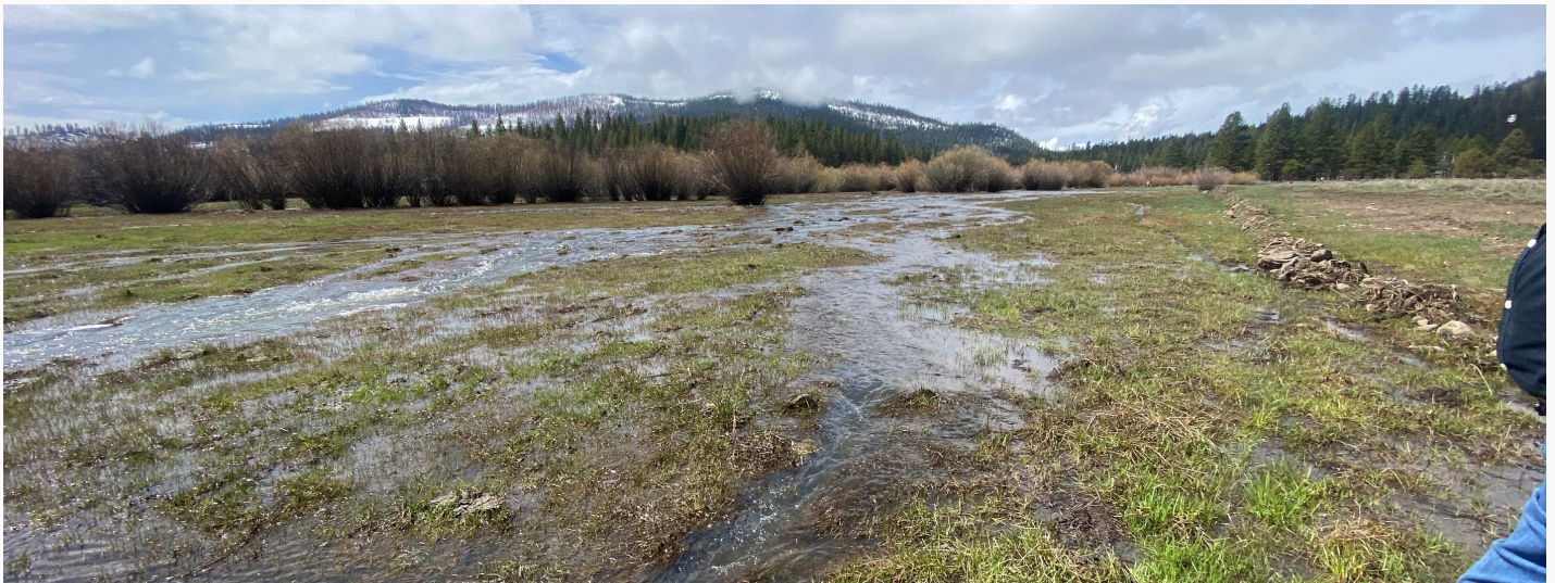
Thomas Creek on the upper end of Cox Flat. This is a desired condition of a stage zero project where the flow is not confined to the channel during high flow events.