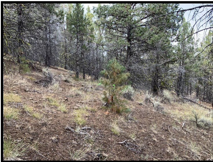
Pre-cut looking north 9-25-23