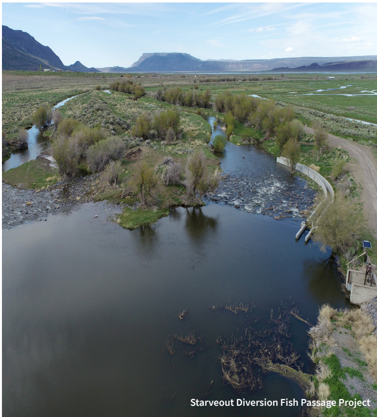
Starveout Diversion Fish Passage Project