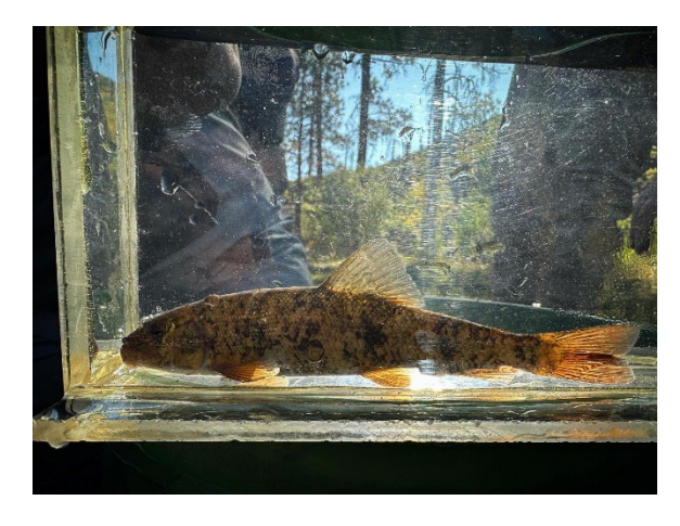
Goose Lake Sucker