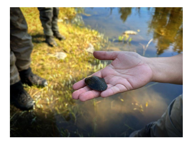
California Floater