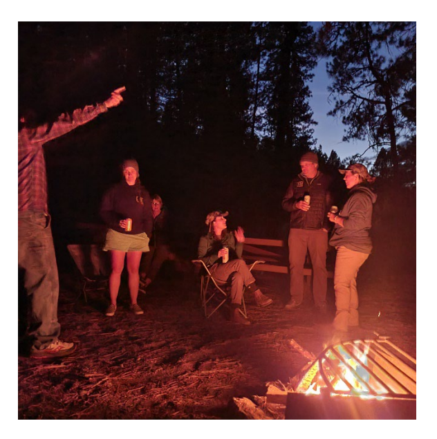
Gathering around the campfire as the sun sets.