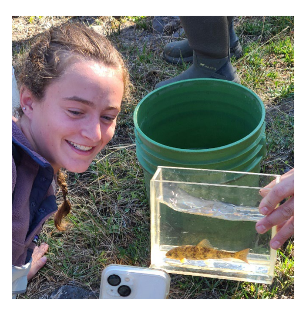
A sucker selfie.