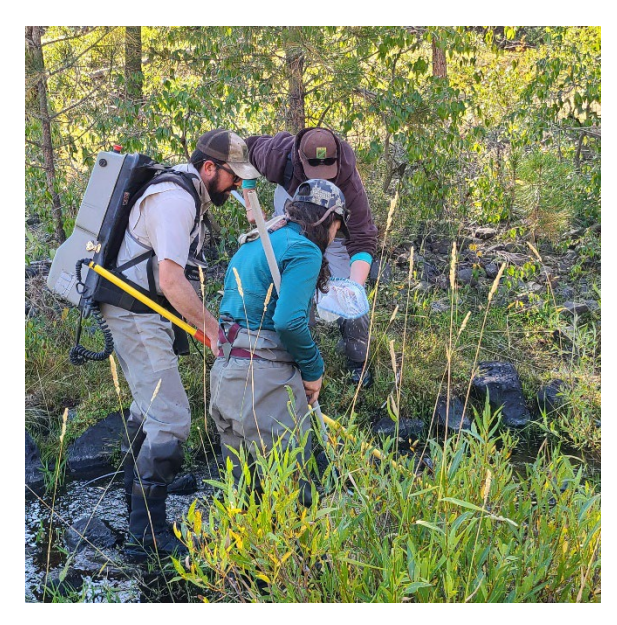
Checking nets during shocking.