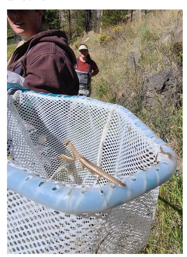
Praying Mantis collected at Hay Creek.