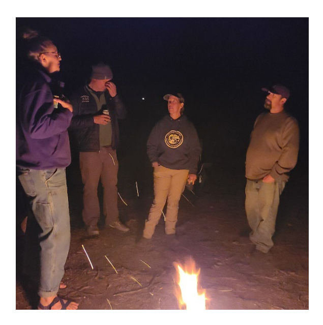
Fireside at Drews Creek Campground.