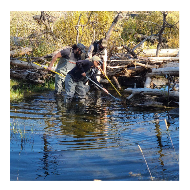
Electrofishing Hay Creek.