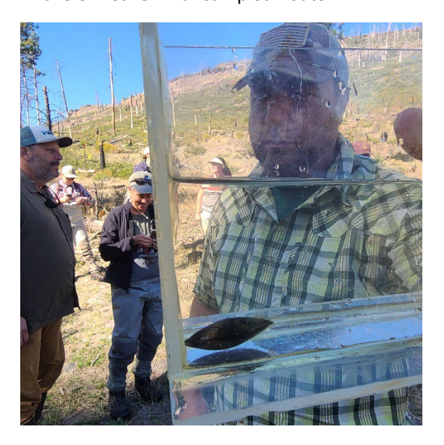
California floater collected in Hay Creek.