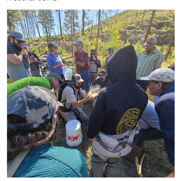
The group sorting collected fish.