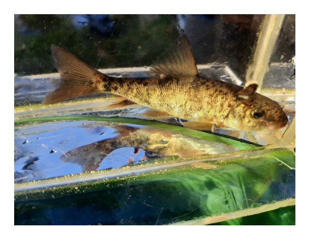
Goose Lake Sucker