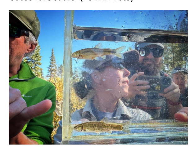
Pit Roach (top) and Speckled Dace (bottom)