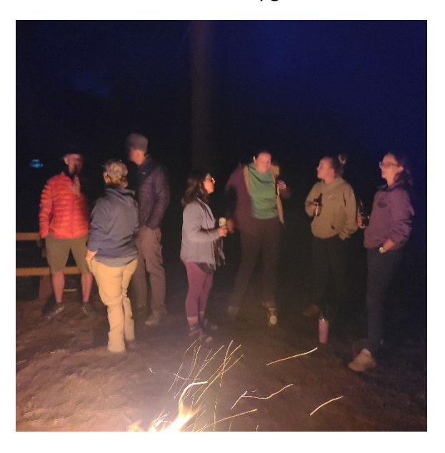
Fireside gathering at Drews Creek Campground.