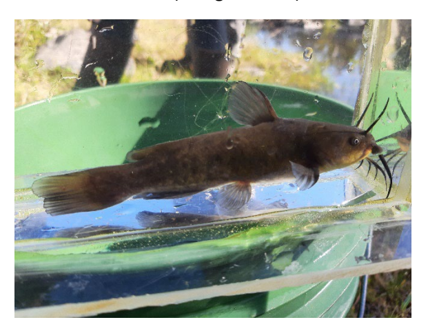
Brown Bullhead