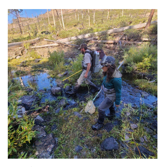
Electrofishing Hay Creek.