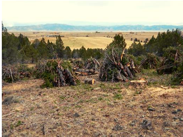
Hand Cut and Hand Piled

Local contractors are hired to complete the work while the LCUWC stays involved to see the project through from start to finish.