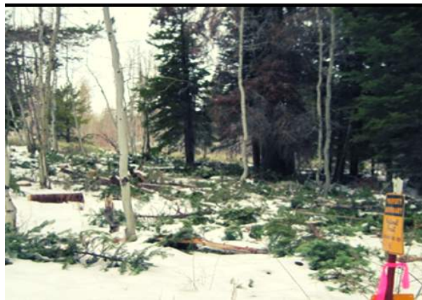
Hand Cut, Lop and Scatter