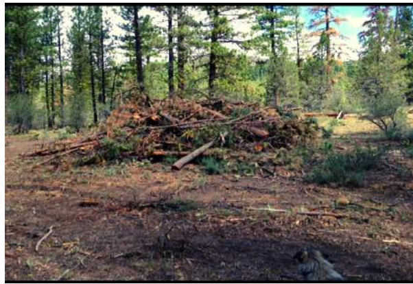
Hand Cut and Machine Piled