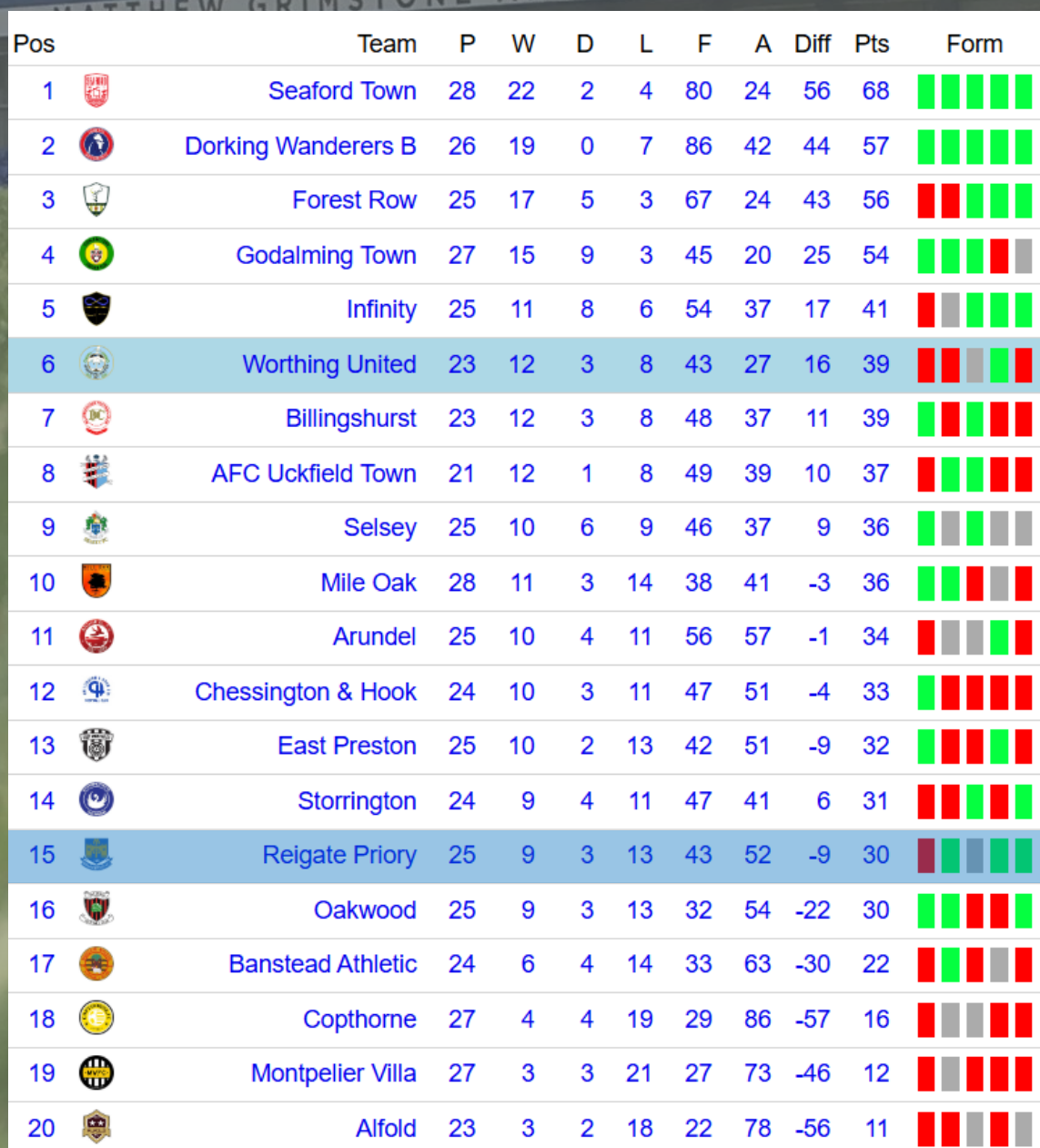
TABLE CORRECT AS OF 15:00 GMT ON 27/2/25