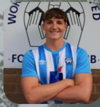
J. LAW (DEF) 25 APPEARANCES, 0 GOALS AGE: 23 YEARS OLD