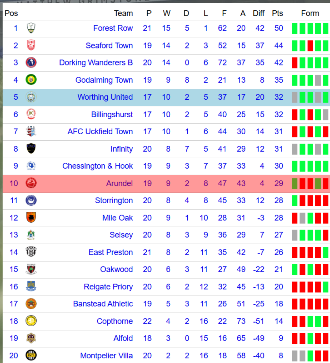
TABLE CORRECT AS OF 10:00 GMT ON 28/12/24