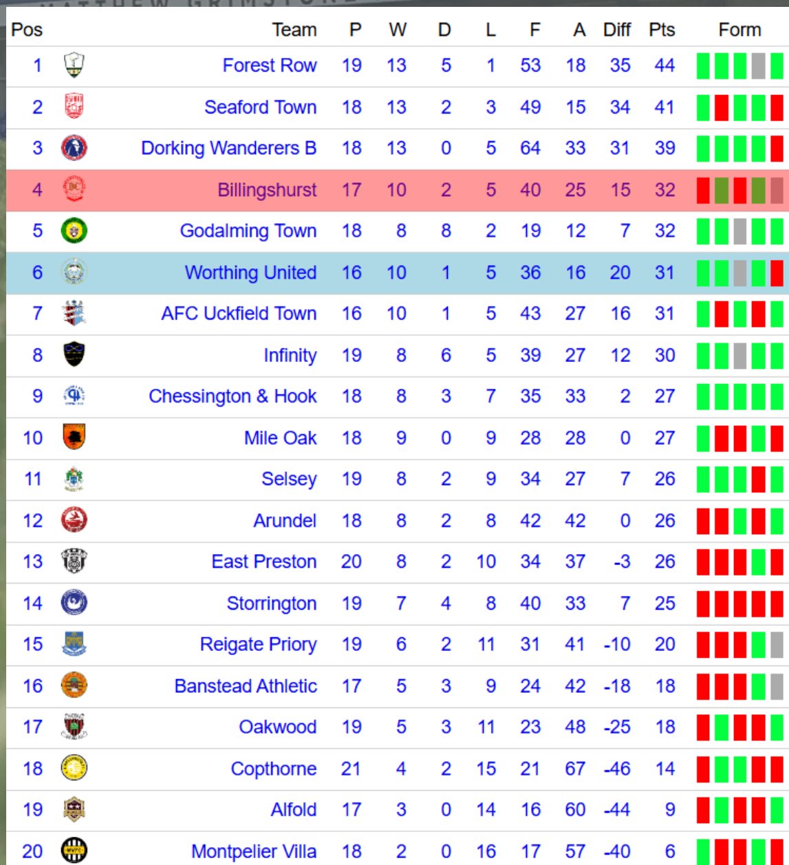
TABLE CORRECT AS OF 12:00 GMT ON 5/12/24