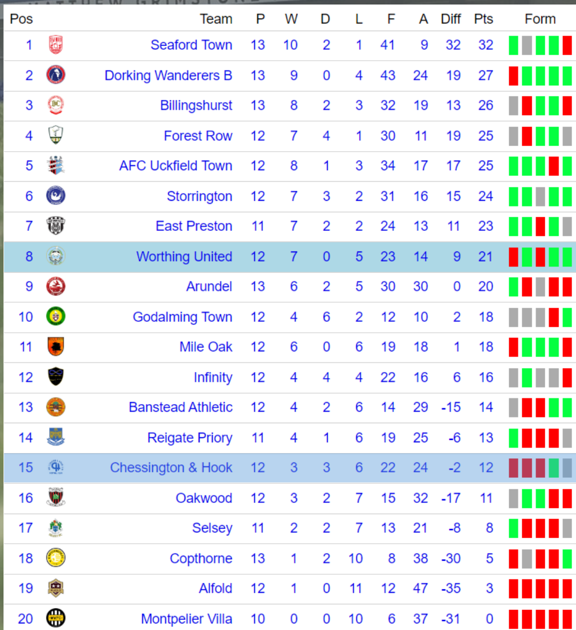
TABLE CORRECT AS OF 16:30 BST ON 16/10/24