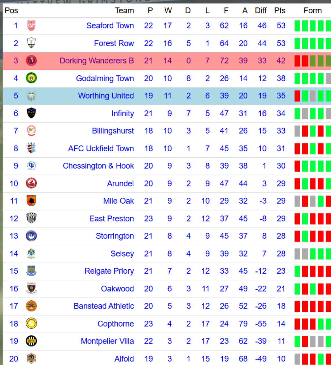
TABLE CORRECT AS OF 10:00 GMT ON 28/12/24