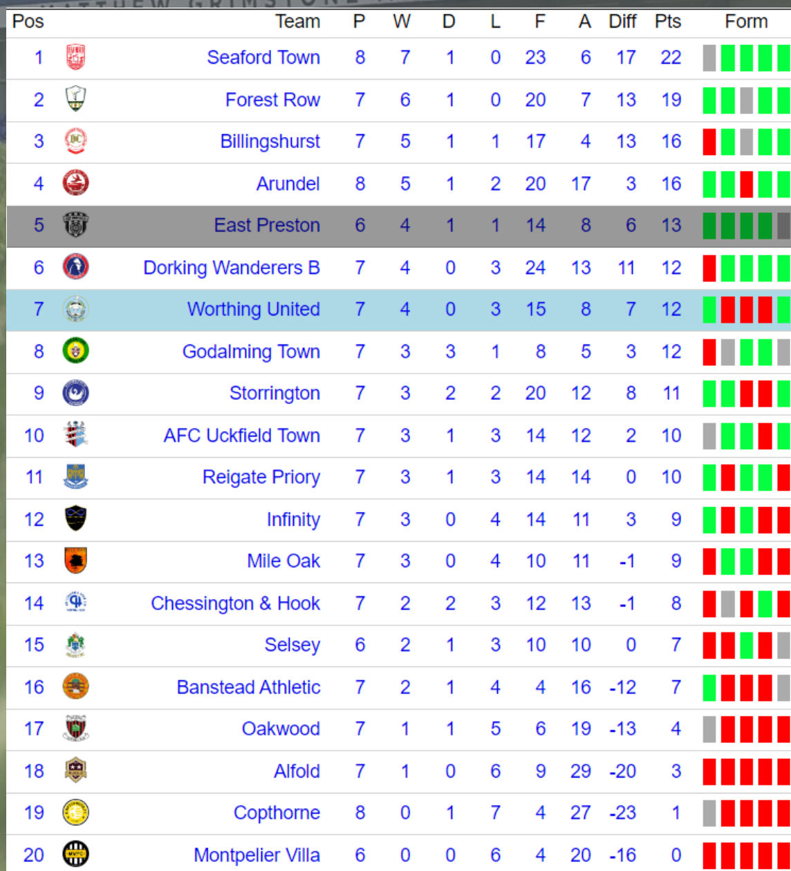
TABLE CORRECT AS OF 17:15 BST ON 8/9/24