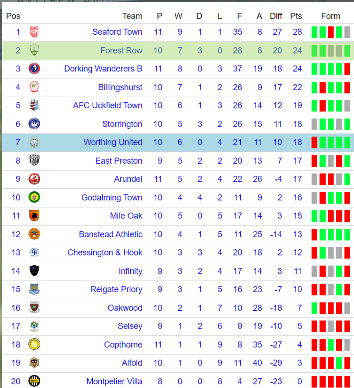
TABLE CORRECT AS OF 13:00 BST ON 29/8/24