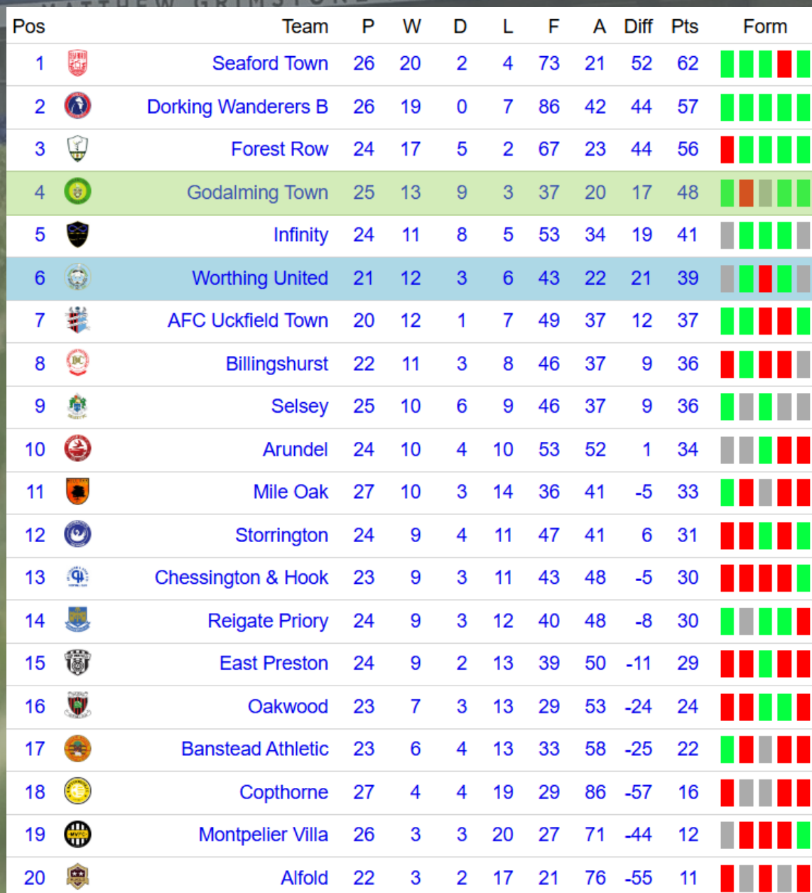
TABLE CORRECT AS OF 22:00 GMT ON 16/2/25