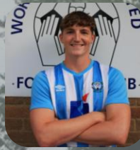
J. LAW (DEF) 25 APPEARANCES, 0 GOALS AGE: 23 YEARS OLD