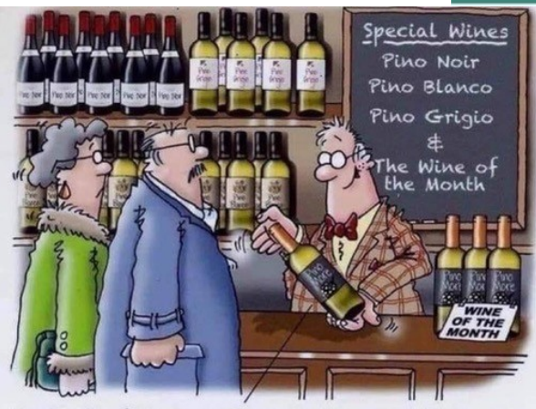
You'll like this one! It's made from an anti-diuretic hybrid grape and reduces the number of trips people your age go to the toilet during the night. It's called PINO MORE!