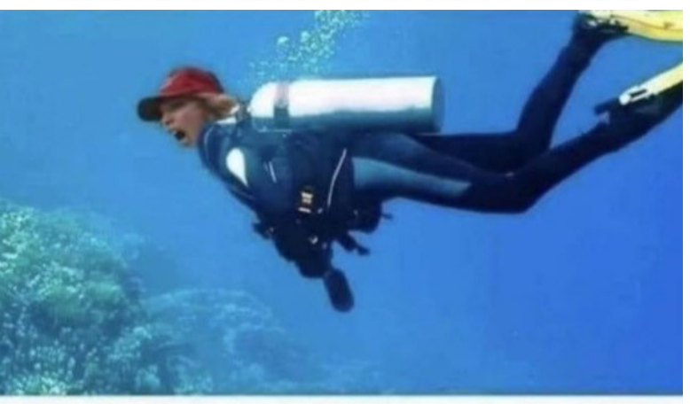
Anti-Masker Drowns After Trying Out SCUBA Diving