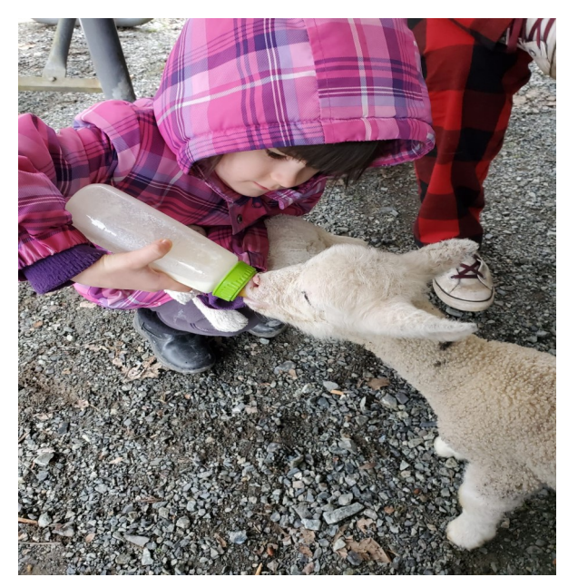
Breakfast Time, by Rick O'Doherty