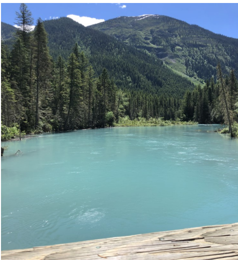
Blue Lake by Michaela