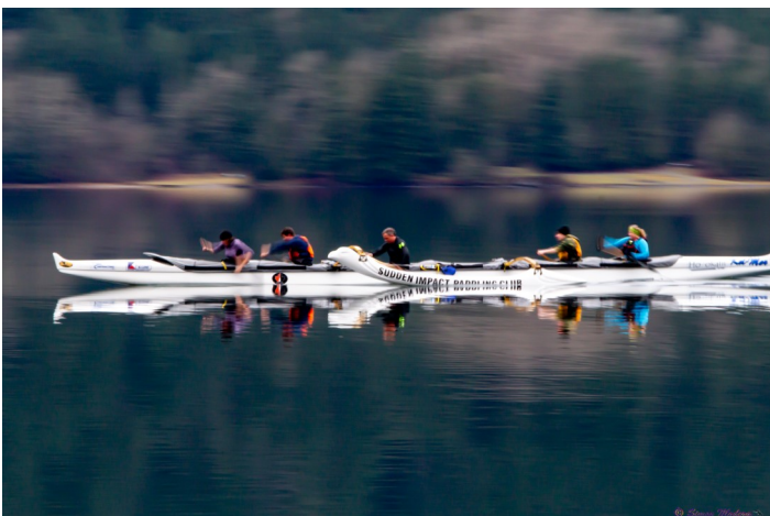
Cultus Lake by Simon