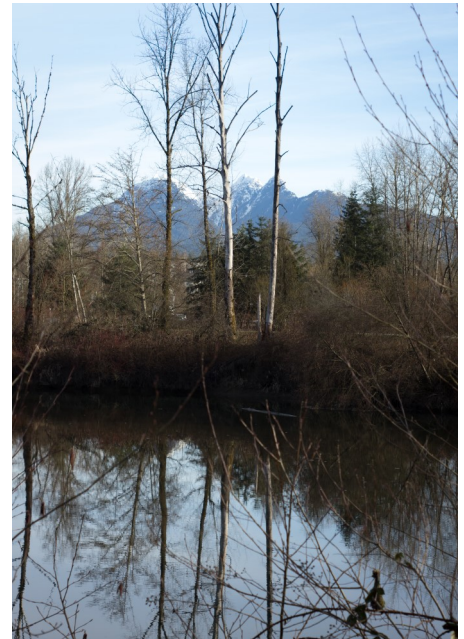
Kanaka Creek