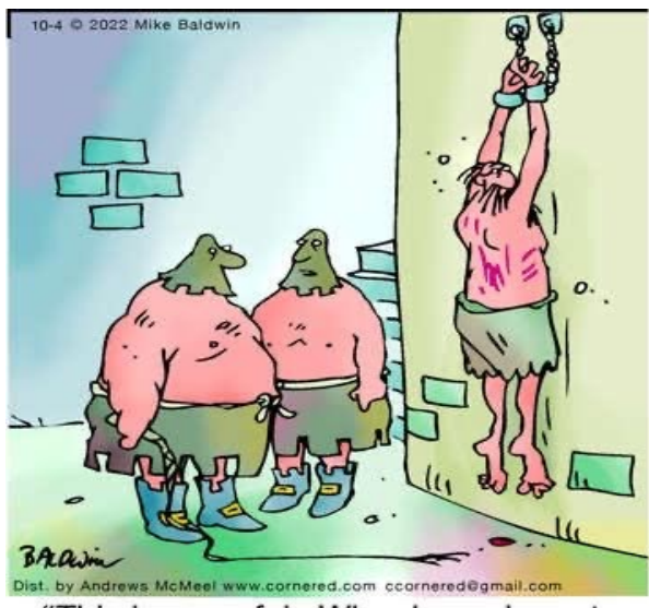
"This is so unfair. Why do we have to wear a mask and they don't?"