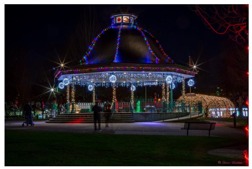
Festive Maple Ridge Bandstand by Simon