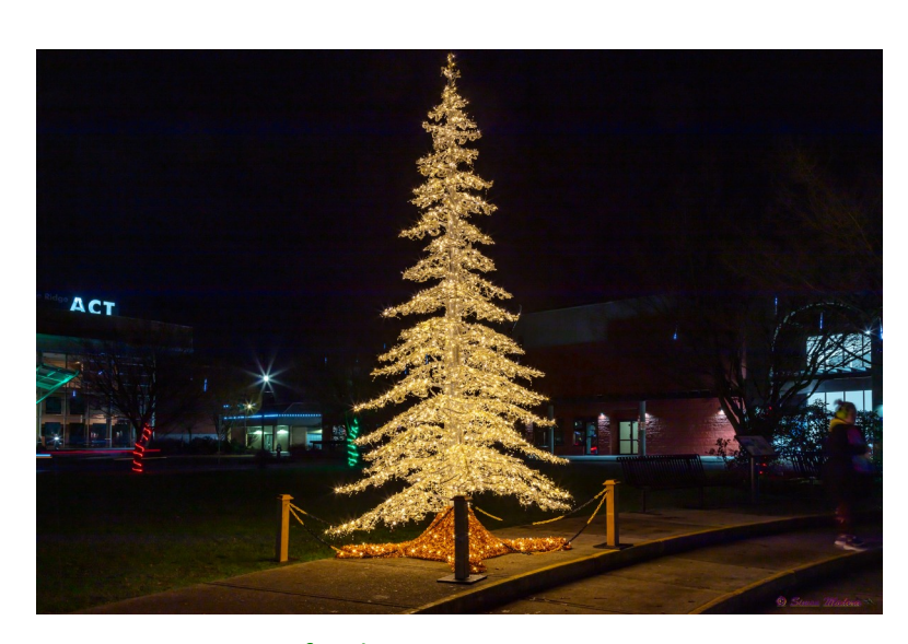
Tree of Light by Simon