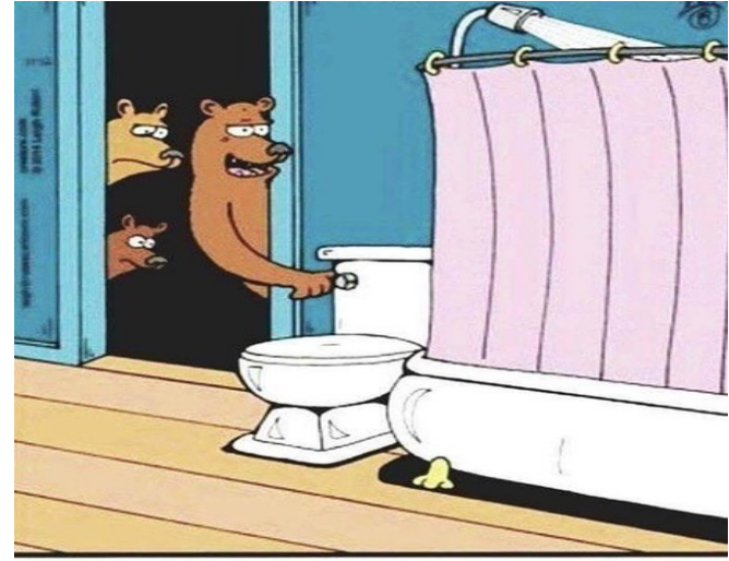
"She complained about the porridge. She complained about the chairs. She complained about the beds. Let's see if we can make it four for four."