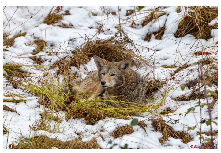
Coyote's snow bed by Simon