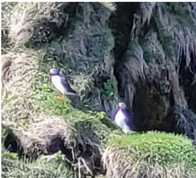
Icelandic Puffins by Tamara O'Doherty