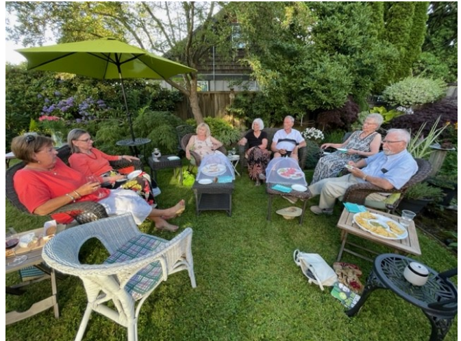
The Wine Club in action