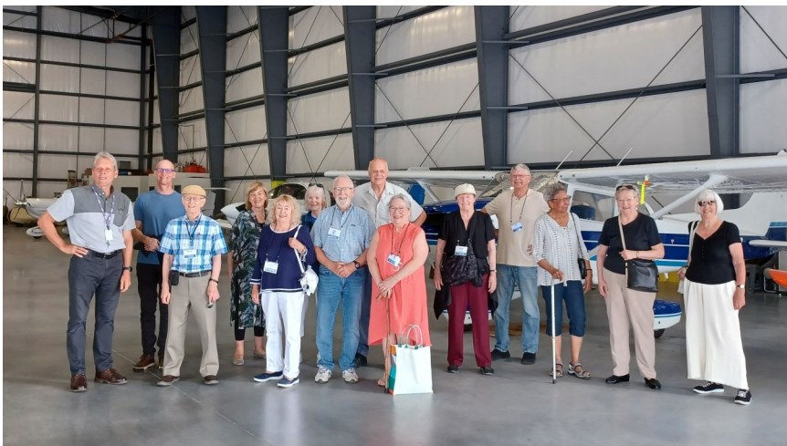
Pitt Meadows Airport Tour