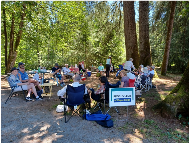
Annual 'Picnic in the Park'