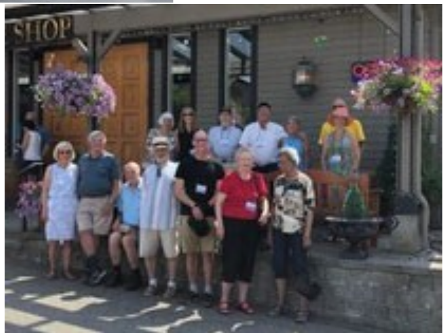
Annual Winery Tour