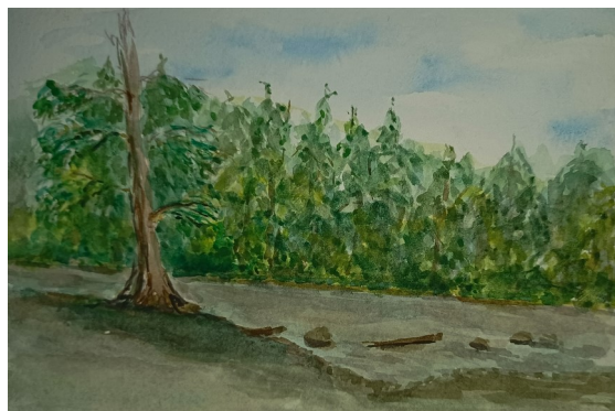
River in the Park, as a watercolour sketch