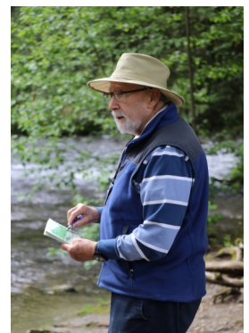
Probus Club of Maple Ridge