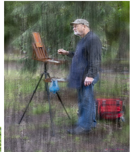
'The Artist', (wet lens camera effect ) by Simon