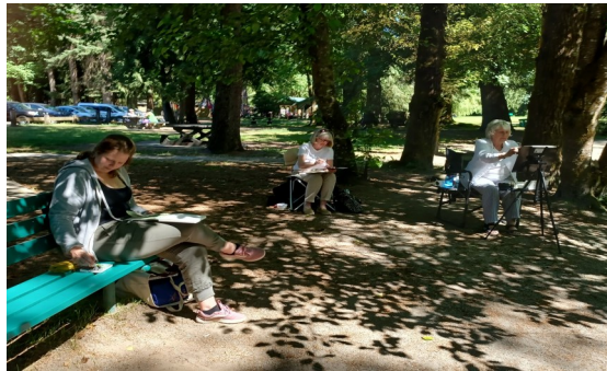
Artists busy working