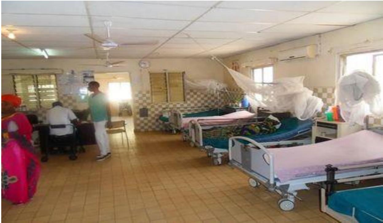
Maternity Ward, Sukuta Health Center

We provide educational, legal aid, healthcare, and social programs to impoverished communities in The Gambia and the United States. Your sponsorship will benefit those we serve.