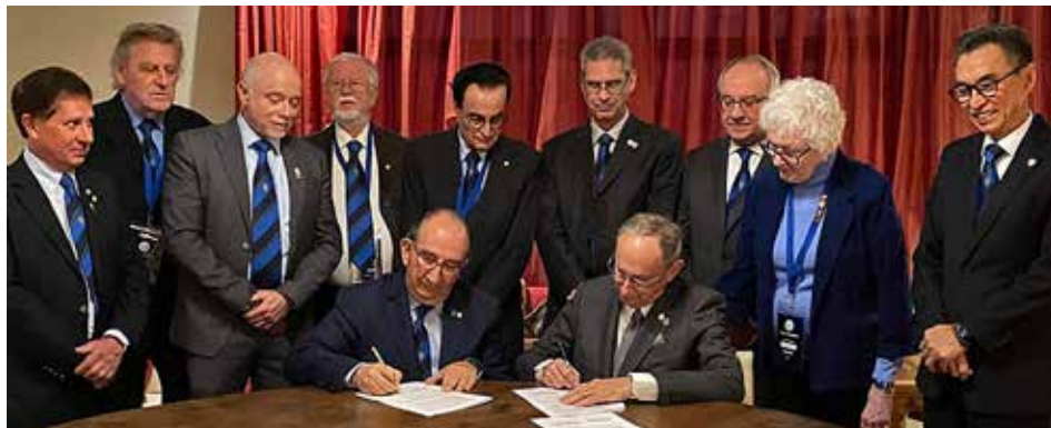
Signing 2022 Memorandum of Understanding

3- A joint PSA-FIAP Photojournalism definition is agreed for implementation beginning January 1, 2024. PSA will implement this definition in January 2023.